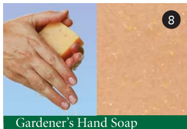
Gardener's Hand Soap

Scented with the traditional scents of Germany—bergamot, cinnamon, lavender, lemongrass and orange.