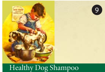
Healthy Dog Shampoo

Refreshing blend of orange, tangerine and lemongrass oils invigorates your senses. Oatmeal gives a soothing scrub.