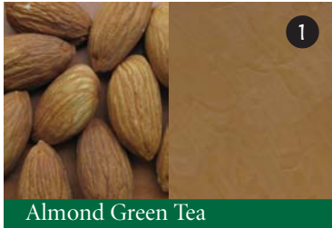
Almond Green Tea

Natural almond aroma scents this bar. Sweet almond oil is the moisturizer. Green tea is good for you, too.