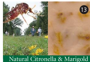
Natural Citronella & Marigold

Coarsemeal gently scrubs hands clean. Shea butter leaves hands silky smooth. Citrus scent.